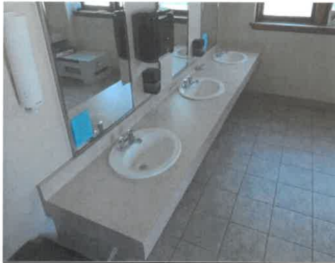
Figure 28 - Women's Lavatories