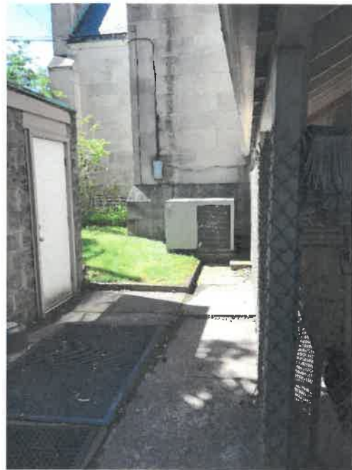
Figure 10 - Outdoor Condensing Coil