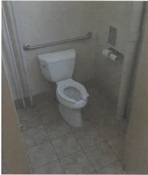
Figure 24 - Men's Water Closet