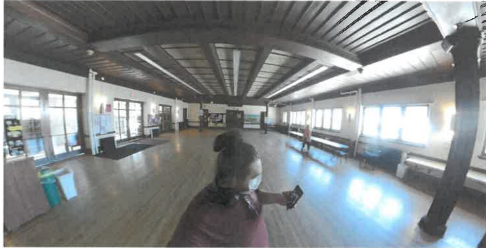
Figure 6- The Parish Hall serves in many ways as the front facing hub of the church and has been maintained extremely well. Only minor issues were noted in the assessment.