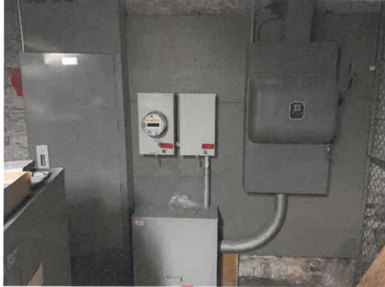
Figure 32 - MDP, Utility Meter and Service Disconnect