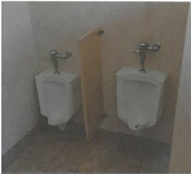
Figure 25 - Men's Urinal