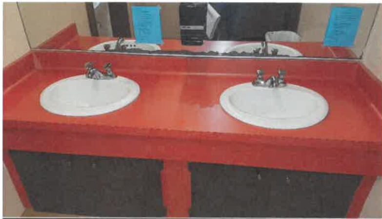
Figure 23 - Basement Lavatories