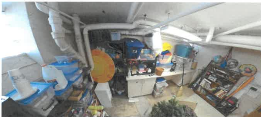
Figure 4- VCT tile and floor base has been removed.