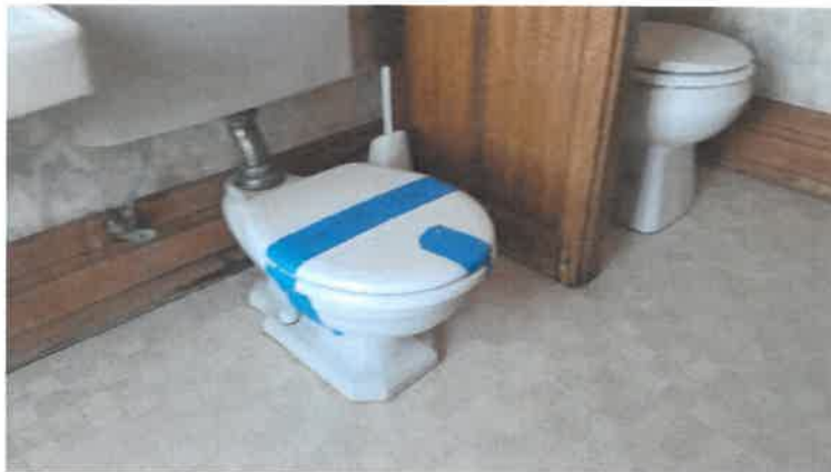
Figure 29 - Second Floor Water Closet