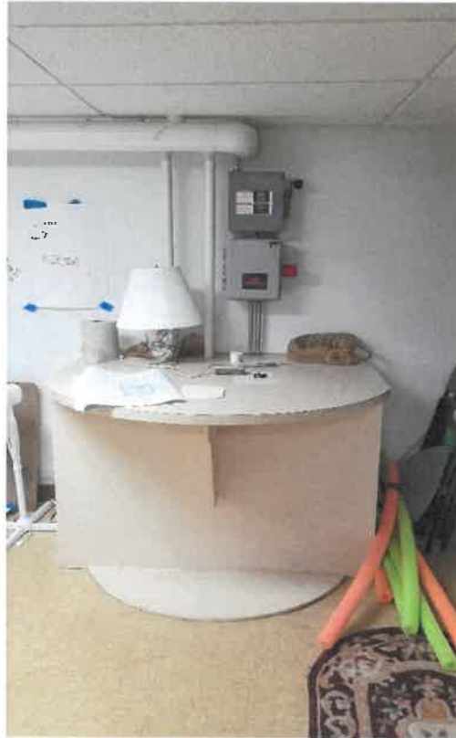
Figure 17 - Meeting Room 018 Sump Pump System