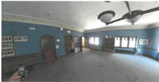
Figure 8- Wear and tear is visible in the large meeting area on the second floor is visible on the carpet. The other finishes and assets present in the space appear to be in moderate to excellent condition.