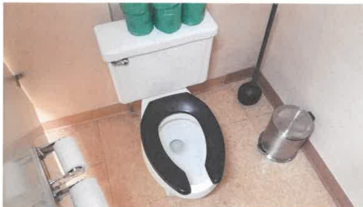
Figure 21 - Basement Water Closet