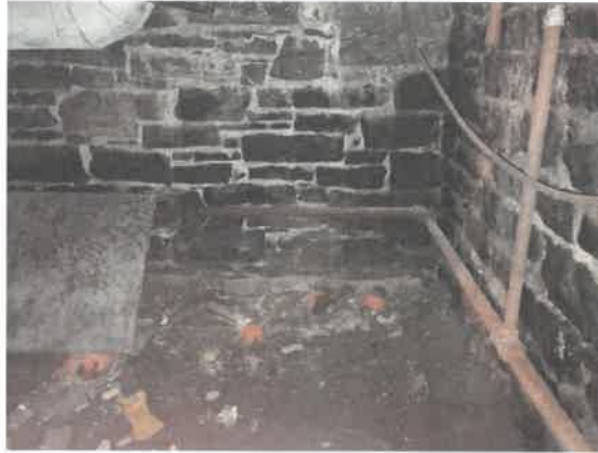
Figure 5- Typical stone foundation- note the loose mortar present.