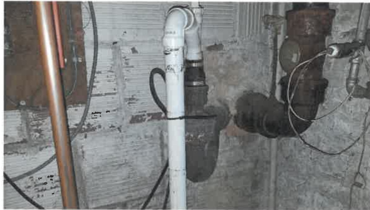
Figure 19 - Cast Iron Sanitary Waste Piping