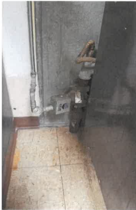
Figure 31 - Kitchen Gas Emergency Shutoff Valve