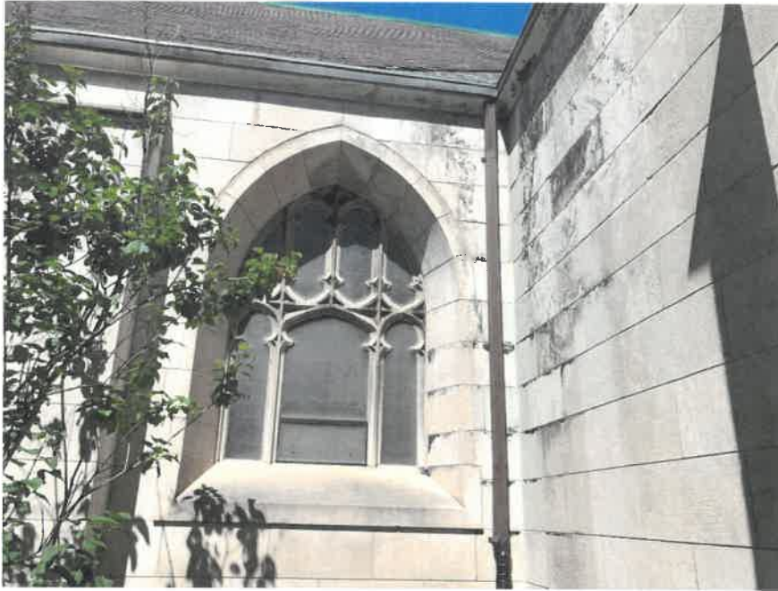
Figure 3 View of stone gutters along East (Brittany Ln.) facade. The discoloration of the stone is likely due to corrosion of reinforcing or anchorage and water infiltration.