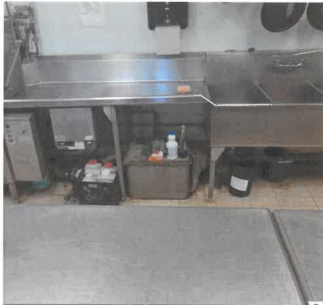
Figure 20 - Kitchen Grease Trap