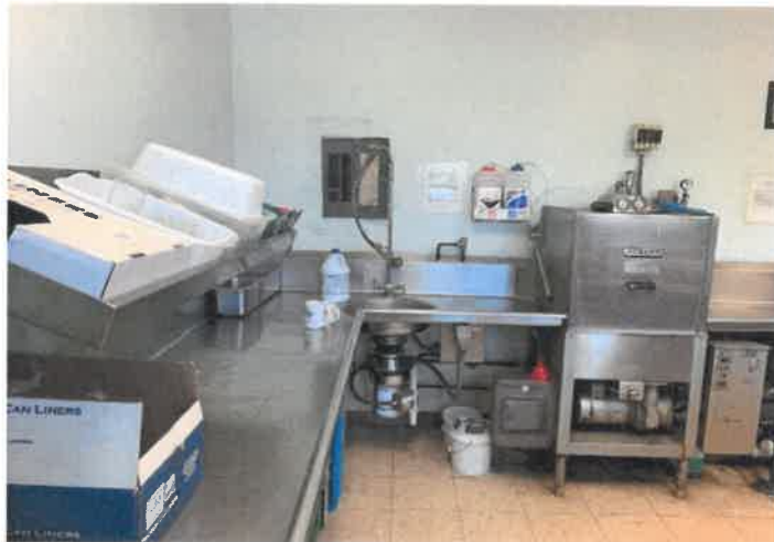
Figure 35 - Panelboard Kitchen Panel