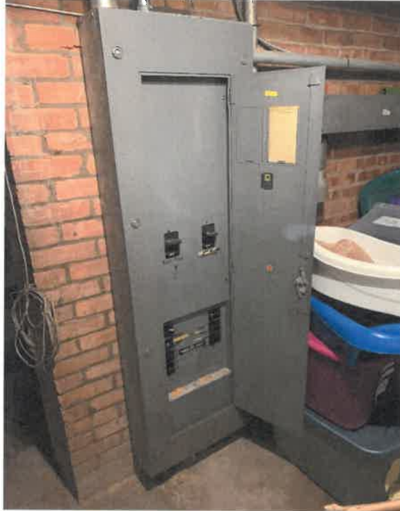
Figure 33 - Old Main Distribution Panelboard