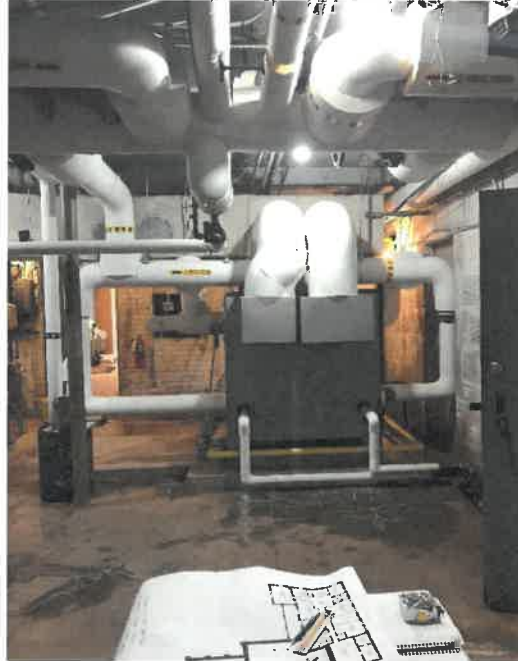
Figure 11 - Steam Boiler