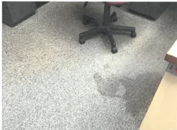
Figure 7- Wear and tear is visible in the semi-private offices and areas of frequent staff use. These are minor issues that can either be completely ignored or addressed with replacement depending on the congregation/ committee priorities.