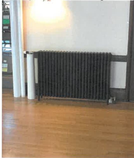
Figure 14 - Typical Radiator