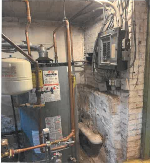
Figure 34 - Panelboard LPBRM-1