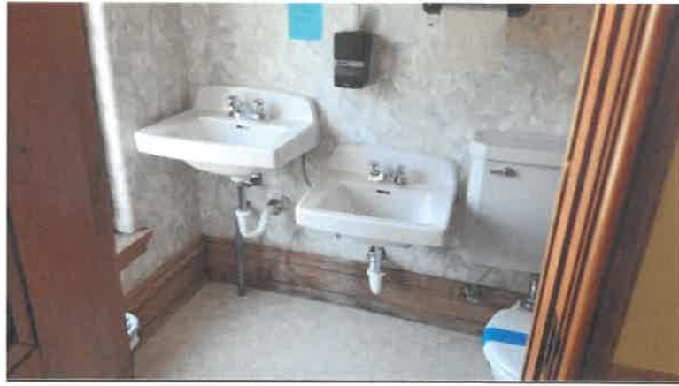
Figure 30 - Second Floor Lavatories