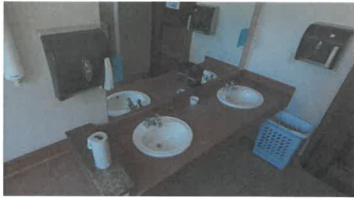
Figure 26 - Men's Lavatories