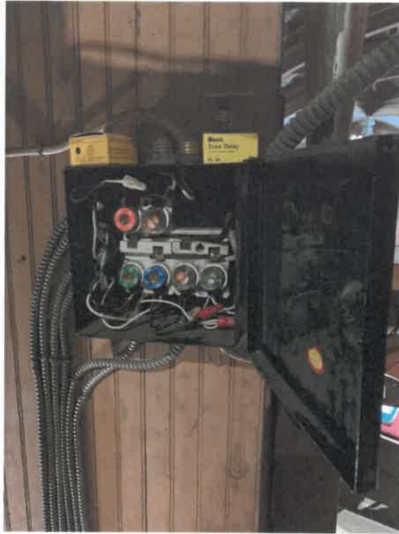
Figure 36 - Fused Loadcenter