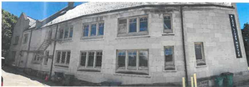
Figure 2 - North facade of the church, Elmwood Ave. is on the right.