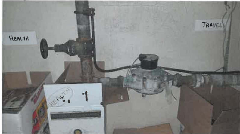
Figure 15 - Domestic Water Service

of the pipe thus increasing resistance to water flow. This is of little concern unless plumbing fixtures in the building are observed to have very little water pressure and flow which is not a recently reported issue at this facility.