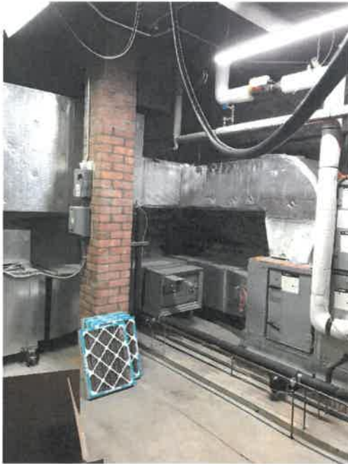
Figure 9 - Interior Air Handling Unit