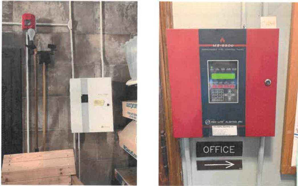
Figure 37 - Existing Fire Alarm Control Panels