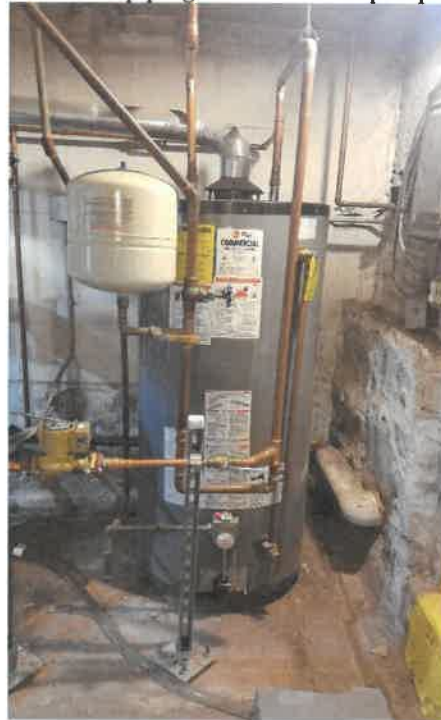
Figure 16 - Domestic Water Heater