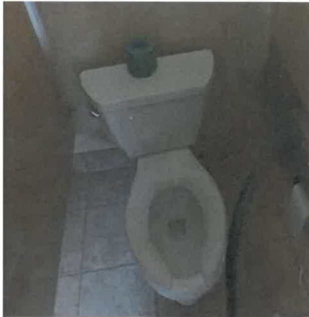
Figure 27 - Women's Water Closet