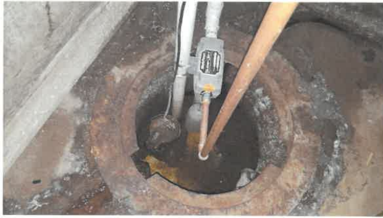
Figure 18 - Boiler Room 009 Sump Pump System