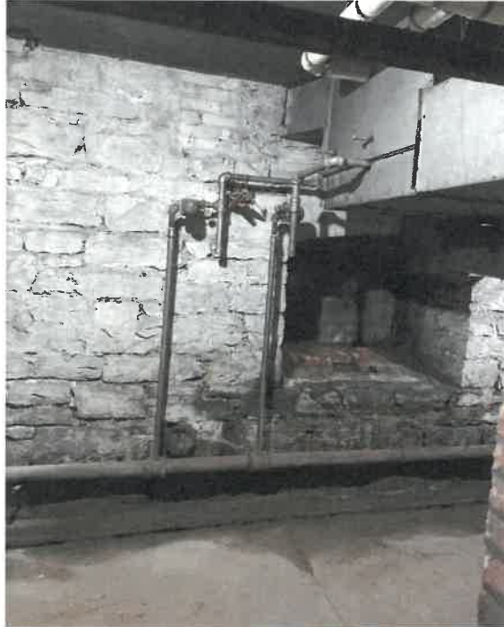
Figure 12 - Uninsulated Steam Piping