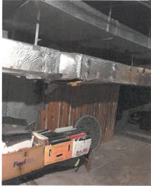
Figure 13 - Insulated Ductwork with Damaged Insulation